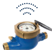
MVCONNECT by Madey Vered