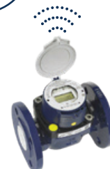
MEISTREAM CONNECT by SENSUS